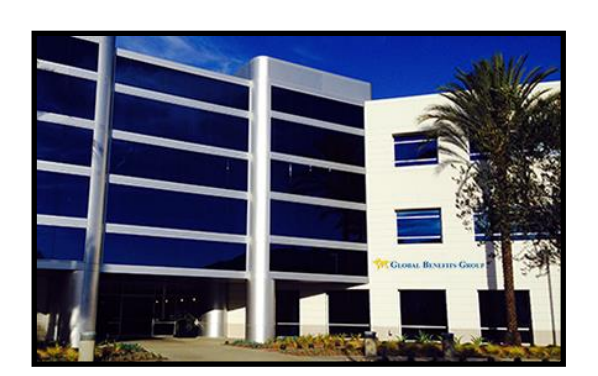
GBG Corporate Headquarters Southern California, USA